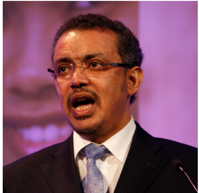
Tedros Adhanom Ghebreyesus, Director General the World Health Organization

And now, the WHO, under the command of Ethiopian Communist, Tedros Adhanom , has done it again. Only this time the WHO’s criminally negligent delays have turned what could have been a controlled epidemic into a global pandemic: affecting some 180 countries; with thousands of sick and dying citizens; overtaxed and collapsing healthcare systems in a globally collapsed economy.