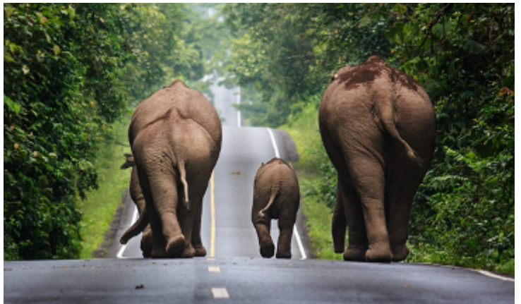
Elephants of Thailand

https://www.axios.com/timeline-the-early-days-of-chinas-coronavirus-outbreak-and-cover-up-ee65211a-afb6-4641-97b8-353718a5faab.html