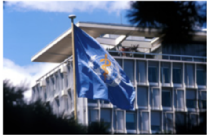
WHO Geneva Headquarters

The WHO offices in China and Geneva also missed all of this too. Mind you, it was only on national TV and the WHO already knew of human-to-human transmission, which they didn't bother to tell anyone.